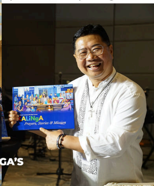
A NIGHT OF HOPE AND HEALING: CELEBRATING A DECADE OF KALINGA'S MISSION