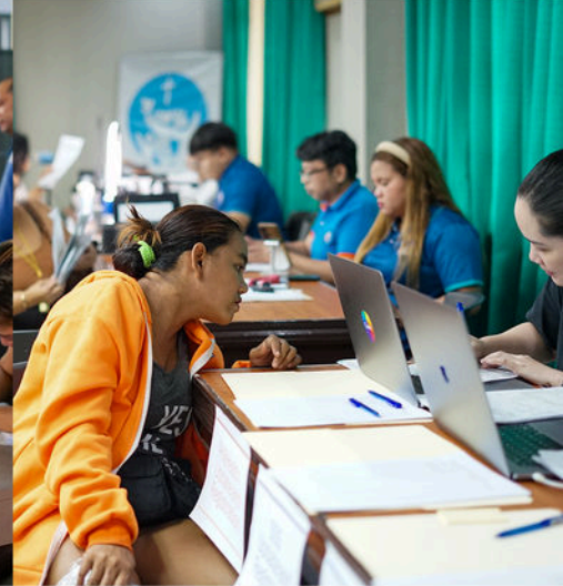
KALINGA CENTER PARTNERS WITH CANVA AND PSA TO PROVIDE FREE GOV'T DOCUMENTS TO HOMELESS BENEFICIARIES