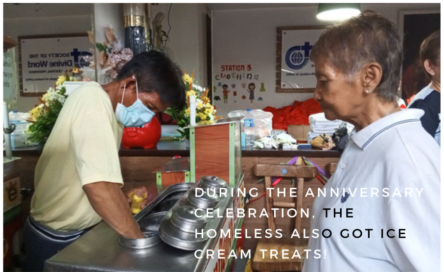
DURING THE ANNIVERSARY CELEBRATION, THE HOMELESS ALSO GOT ICE CREAM TREATS!