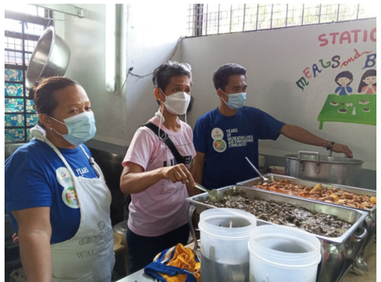
THE 9TH ANNIVERSARY MENU AT THE CENTER INCLUDED KALDERETA AND LAING, AS WELL AS ICE CREAM.

It was a day to look back to in thanksgiving to God's Providence to the Center, which continues to carry out its mission to the homeless of Manila. ■