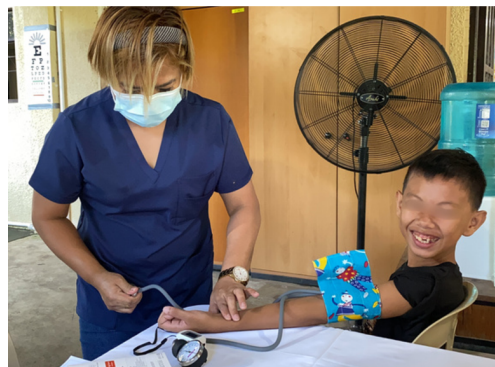
A KID GRINS AS HIS BLOOD PRESSURE IS BEING TAKEN DURING THE MEDICAL MISSION.