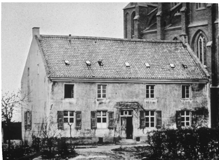
THE FIRST DIVINE WORD MISSION HOUSE WAS IN STEYL, NETHERLANDS.