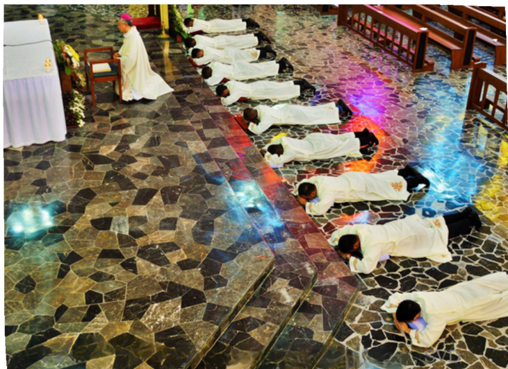
SVD FRATERS ARE ORDAINED TO THE DIACONATE AT THE DIVINE WORD SEMINARY IN TAGAYTAY CITY.